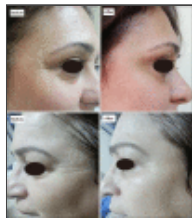
Fig. 3 Periorbital wrinkles before platelet-rich plasma (PRP) treatment and clinical improvement of periorbital wrinkles after PRP treatment.

All patients' preoperative and postoperative (at one month) photographs were documented ( Fig. 3 ), but we did not evaluate the efficiency of PRP treatment with these photographs. We think that histopathologic evaluation of collagen is more important, reliable and objective method than photographic evaluation.